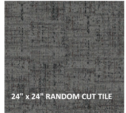
24" x 24" RANDOM CUT TILE