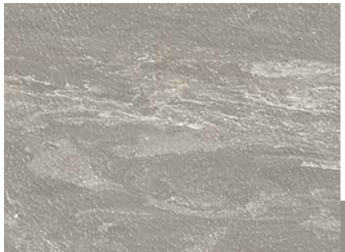
RH9 Cedarstone WG 32 Pebble WG *