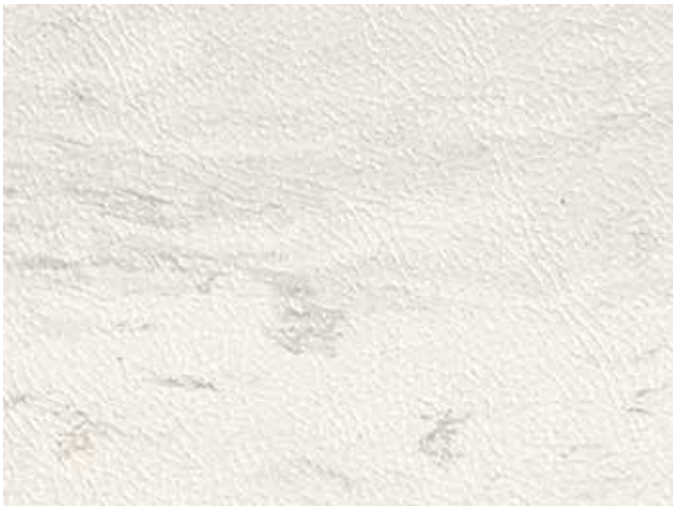
RH4 Dolomite WG 460 Cotton W *