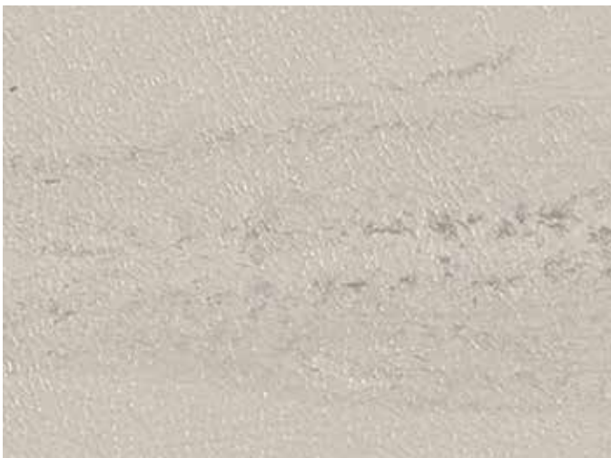
RH8 Quantum CB 24 Grey Haze WG *