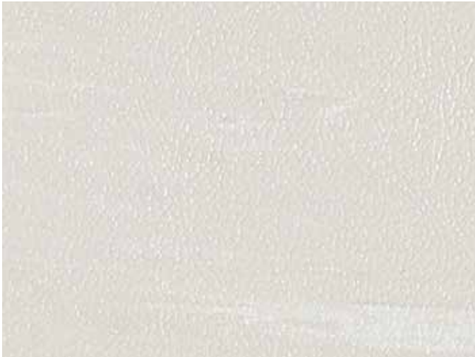
RG9 Crystallized W TB3 Dover CG *