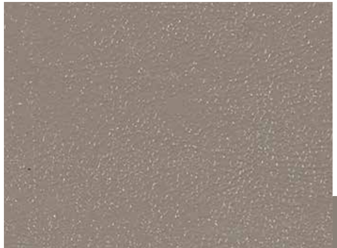
RH7 Brownstone CB TA8 Welsh Castle CB *