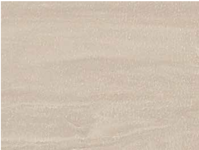
RH6 Emperador CB 31 Zephyr CB *