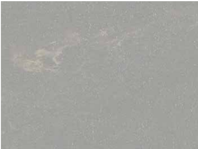
RH2 Quartz CG TA5 Colonial Grey CG *