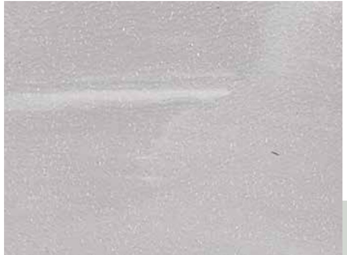
RH1 Marbra CG 23 Vapor Grey CG *