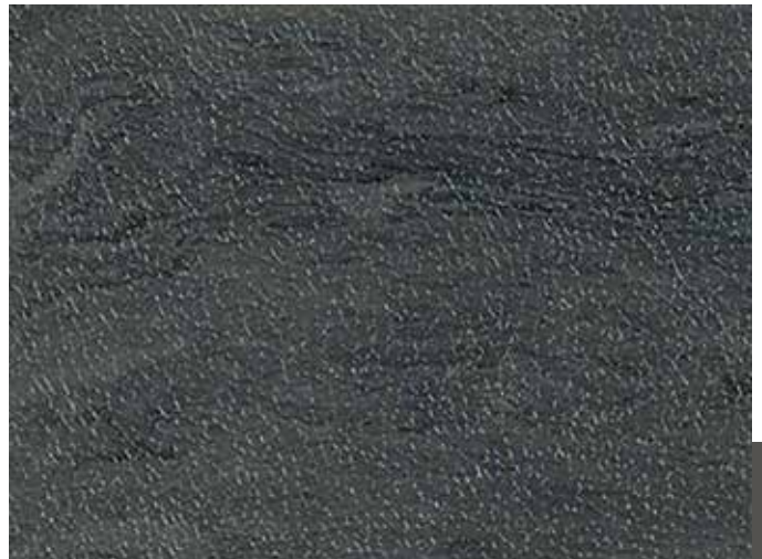
RH3 Jet B 20 Charcoal WG *