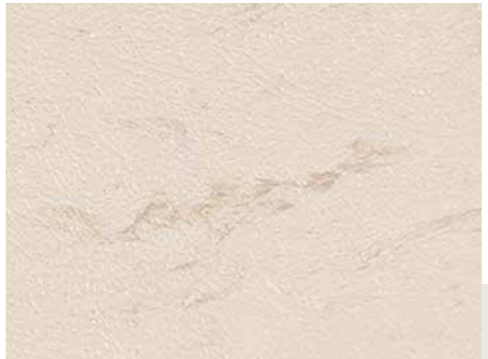
RH5 Calcite WG 27 Mist WG *