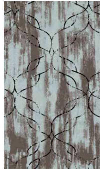
A 8517 B 8504 C 8502 D 8002