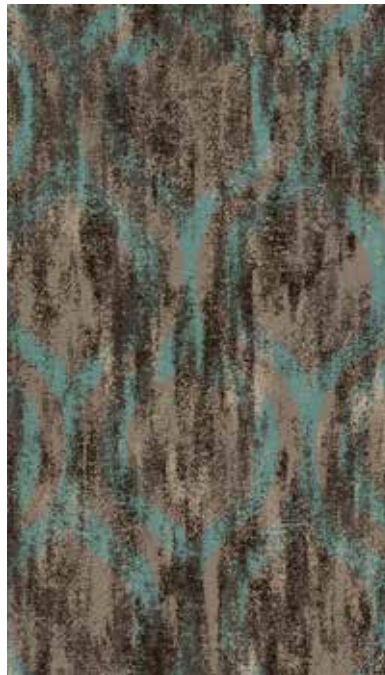
A 7513 B 3510 C 7508 D 4016