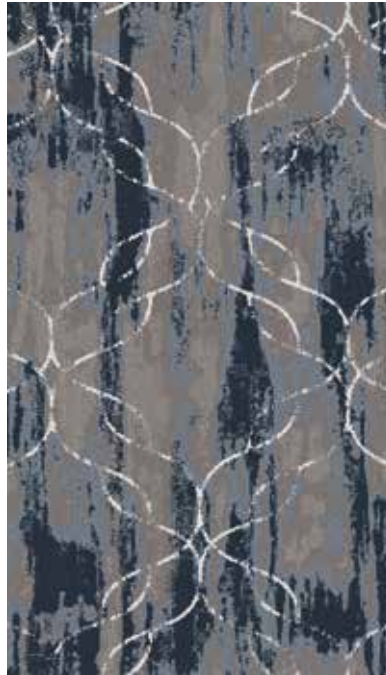
A 8518 B 8003 C 8504 D 8520