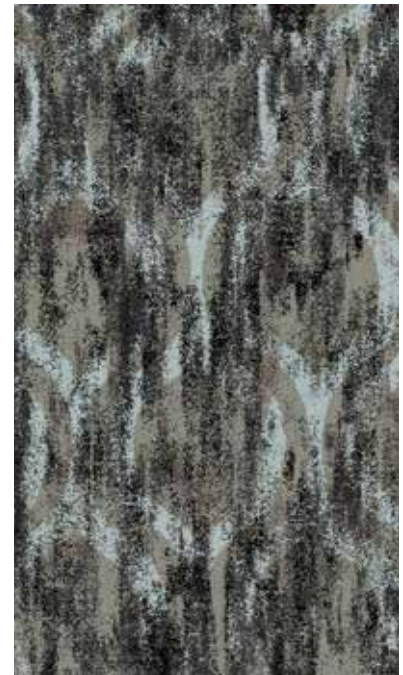
A 8002 B 8517 C 8504 D 8502