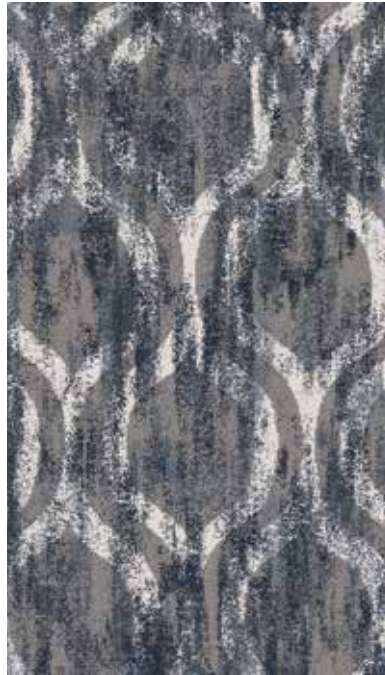
A 8518 B 8003 C 8504 D 8520