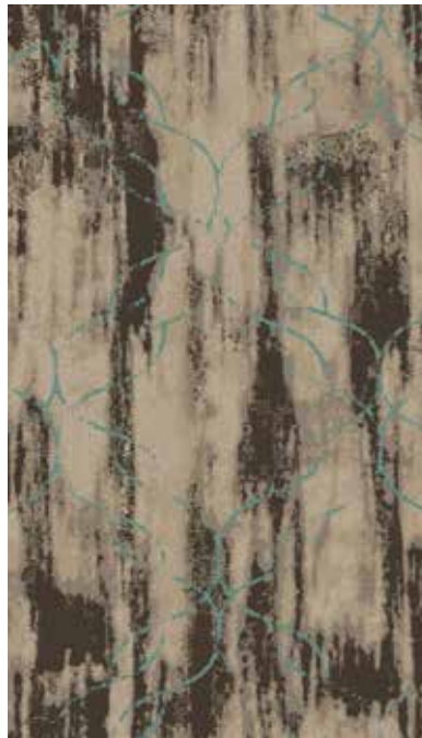
A 7513 B 7508 C 3510 D 4016