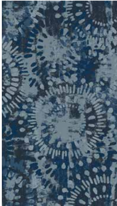
A 8518 B 5003 C 5503