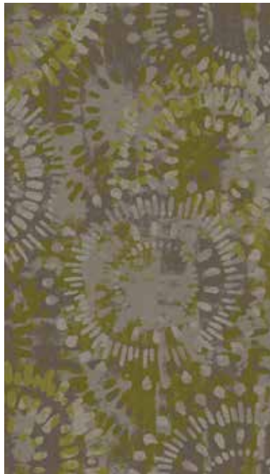
A 8517 B 4510 C 8503