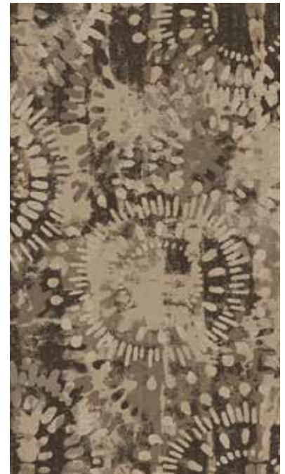
A 7511 B 7508 C 3510